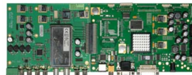
TVtoLCD + CRTtoLCD-7